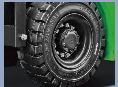
Standard rubber tread tires