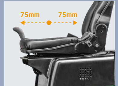
Seat can be adjusted backwards and forwards